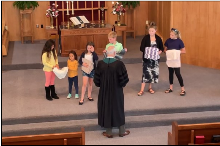
The kids helped bless some prayer shawls on September 17.