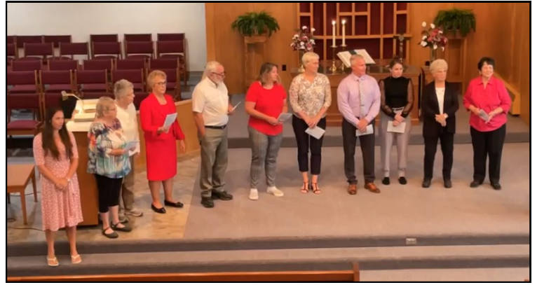
Everyone who helps with our education program was recognized on September 10.