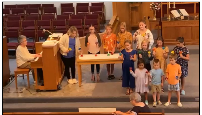
We enjoyed hearing the children's bells play on Sunday, September 24.