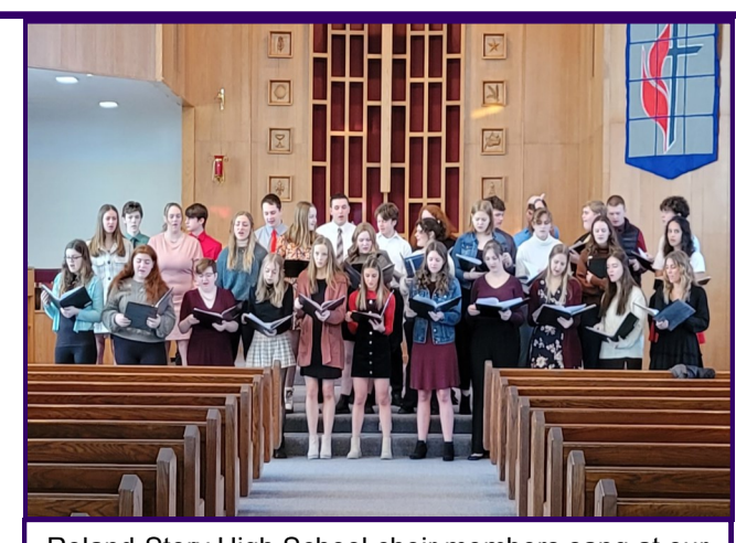
Roland-Story High School choir members sang at our service on January 29 to raise funds for their spring break trip to New York.

The RSHS Choir and the Music, Art, Speech & Theater (MAST) Board