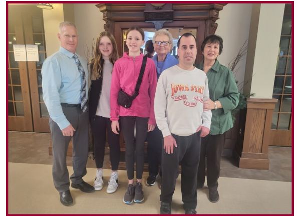
Wheelchair pushers at Bethany Life